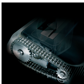
CHAIN heavy duty chain drive system and metal gears