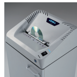
AUTO START & CD SHREDDING Automatic Start/Stop through electronic eyes. Integrated flap for CDs, DVDs, Floppy Disks and Credit Cards shredding