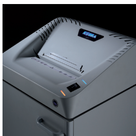
LED INDICATORS Easy to operate ON OFF Reverse switch, with LED signal for bag full or open door