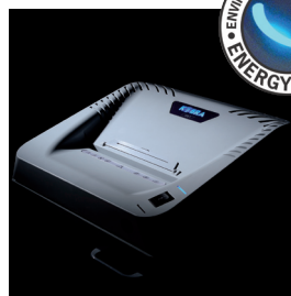
ENERGY SMART ® management system with illuminated indicators for power saving in stand-by mode