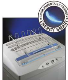
Adjustable computer forms top shelf (Space Saving Design). Integrated sliding flap makes Floppy-Disks and CDs shredding easy