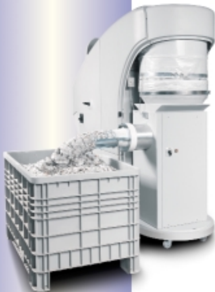
Kobra CYCLONE + COMPACTOR C-500 Kobra Cyclone can be attached to the optional Compactor model C-500 designed to reduce by 4-5 times the volume of the shredded paper