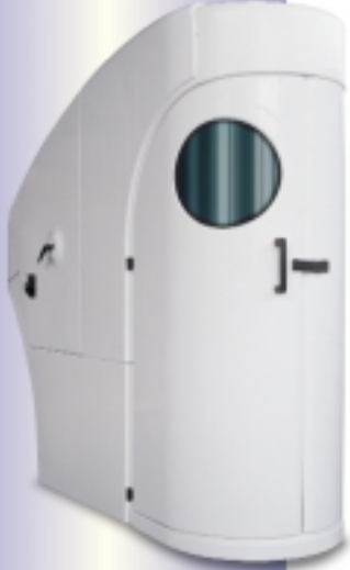
Rear window for easy checking of waste bag level