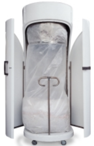
Kobra CYCLONE (standard version) Kobra Cyclone utilizes a plastic waste bag to store shredded materials in an internal storage compartment. Full bags are easily removed and disposed of assisted by the built-in-trolley

Kobra Cyclone is the ultimate development in shredding technology. Blades rotating at a very high speed combined with the power of a turbine providing the unit with an airflow allow the shredding of up to 500 sheets of paper at a time as well as the shredding of many other types of materials into 5 different available particle sizes. The size of the particles (Security Level) can be chosen when ordering the machine and it will always be possible to change the Security Level any time after installation of the unit with a simple operation to adapt to any shredding need. Shredding capacity of 500 sheets at a time remains unchanged with any Security Level installed in the machine. A rear window allows easy checking of waste bag level while plastic bags can be easily removed and disposed of assisted by the built-in-trolley. Kobra Cyclone is also equipped with an integrated vacuum system specifically designed to provide the operator with clean and dust free shredding environment. The Cyclone is built with a double insulated shredding chamber and special plastic outer housing enclosure for low noise operation. Kobra Cyclone can reach an impressive shredding output of 420 Kg. (940 lbs) per hour (Theoretical output) without requiring any oiling of cutting knives or special maintenance. This makes the Kobra Cyclone easy to use for everybody at the office.