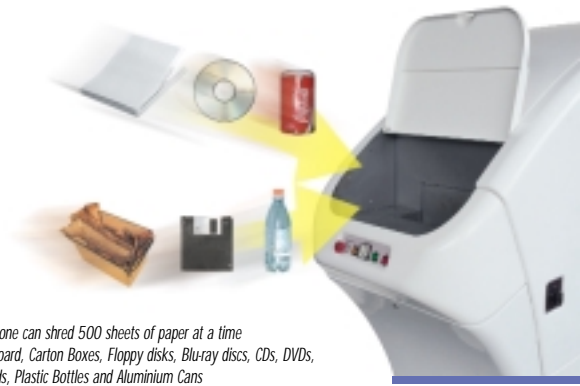
Kobra Cyclone can shred 500 sheets of paper at a time and Cardboard, Carton Boxes, Floppy disks, Blu-ray discs, CDs, DVDs, Credit Cards, Plastic Bottles and Aluminium Cans

Kobra Cyclone is equipped with a turbine generating a high pressure air flow and sets of high speed rotating blades. By making the air stream spin, particles are subjected to centrifugal forces and deposited from the air flow into the disposal bag. This unique shredding system, delivers the highest shredding performance and efficiency along with maximum flexibility in choosing the correct Security and bulk reduction Level for a given application. Cyclone does not require the special maintenance and complicated oiling procedures that other machines with similar output rates do. Cyclone is designed for high volume shredding and maintenance free operation.